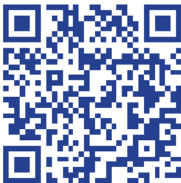
Abstract listing on Frontiers' website

Complete abstracts are available online: